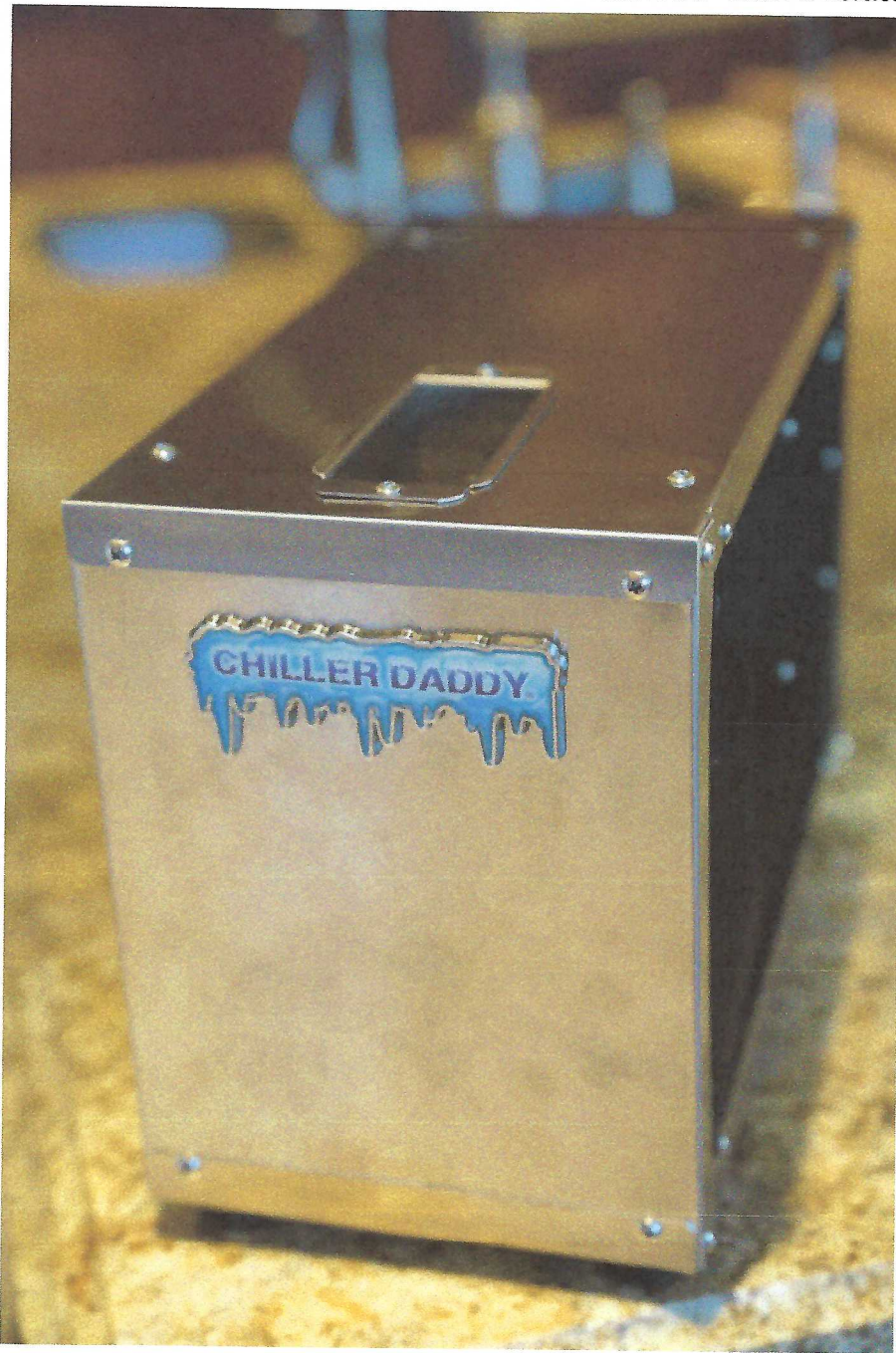
CHL-750XL Under Sink Water Chiller (Learn More About Our Superior Design Approach)